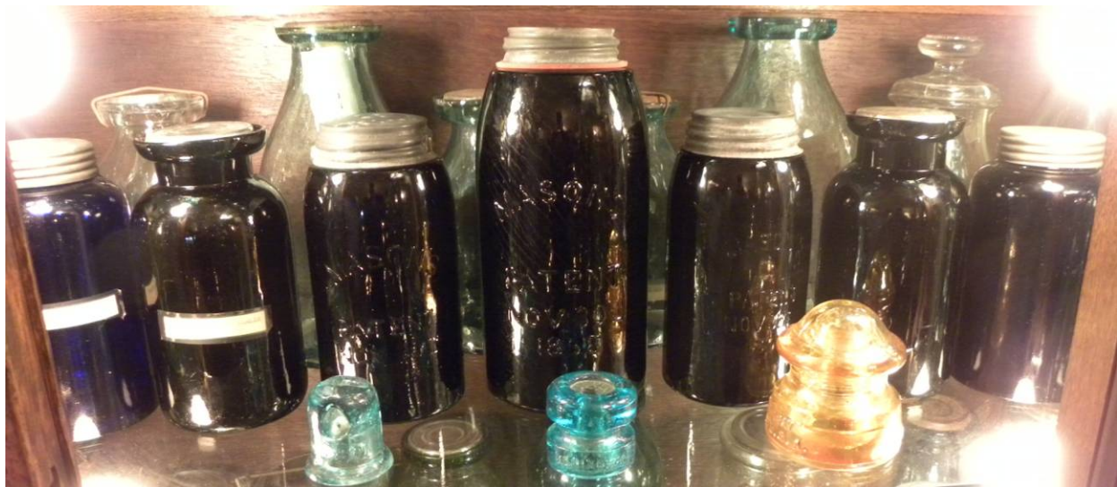
Fabulous lineup of Rare black glass Hemingray Fruit Jars.