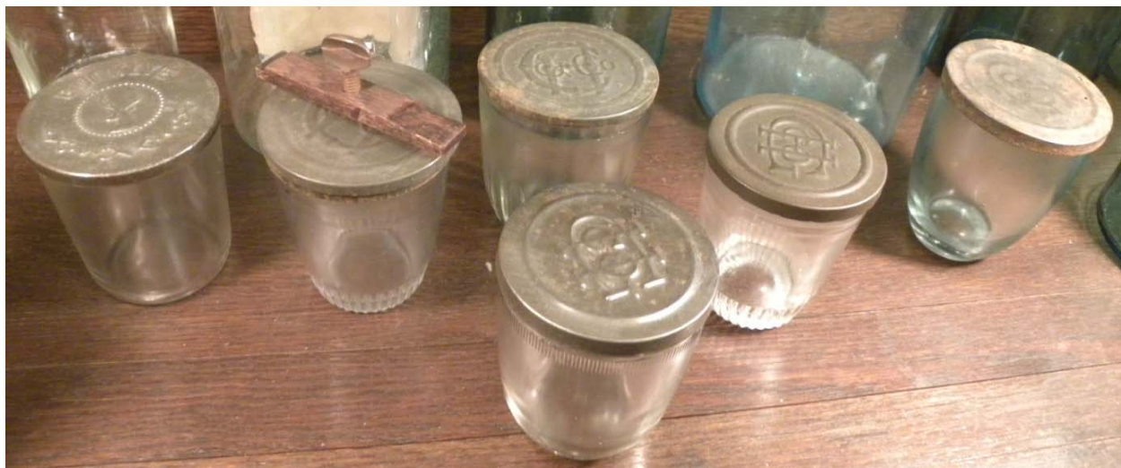
Extremely difficult complete set of Hemingray jelly jars with beautiful original lids.