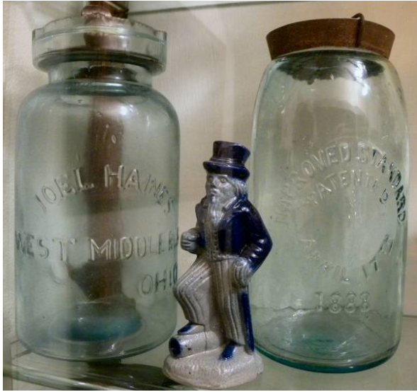
Pair of extremely rare fruit jars.