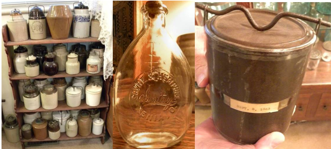
Extremely difficult to find stoneware jars left, rare Xenia baby bottle center, and rare 1863 tin can right.