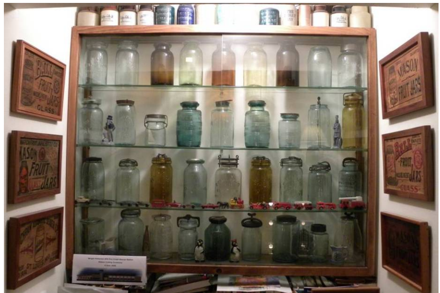
Nice Wall Display of very Rare and scarce Fruit Jars.