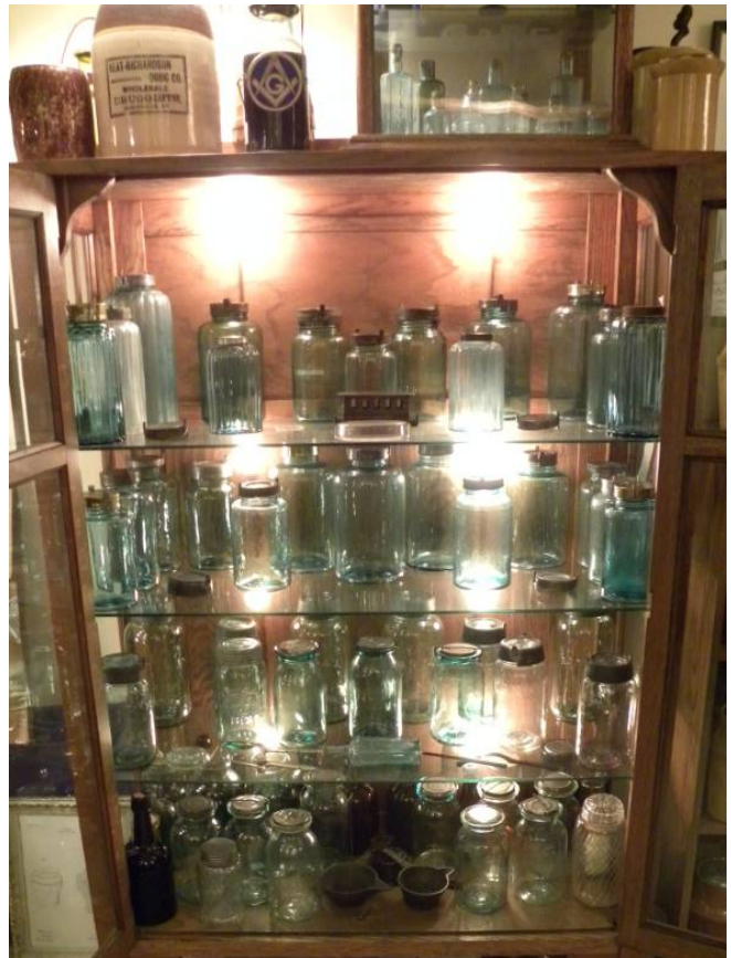
Cabinet of rare Hemingray fruit jars.