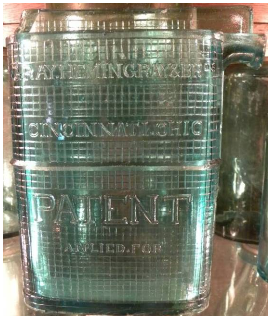
Rare Gray, Hemingray water bottle.