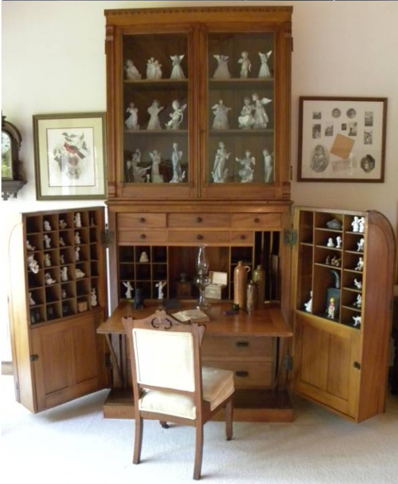
Fabulous antique desk with angels Dick's wife collected.