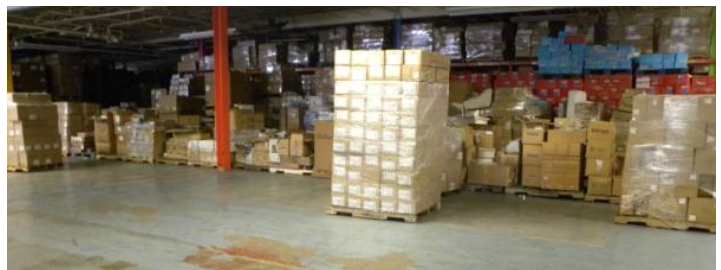
Adjacent warehouse full of donated articles.