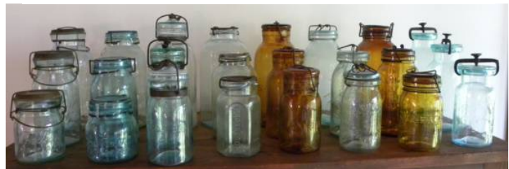
Nice Jar Sets of HG, Qt & Pts.