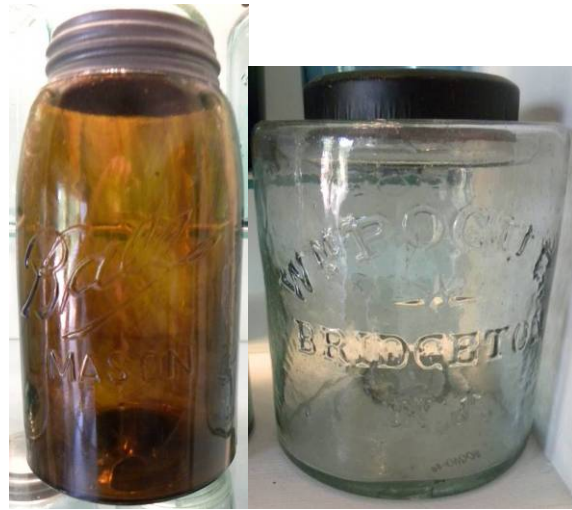
Rare colored Ball Mason & rare So. Jersey Pogue jar.