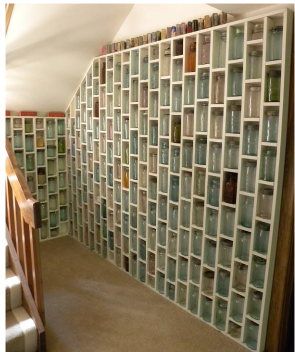
Unusual wall display of really nice fruit jars.

Also, while at Kroger, Dick was against double