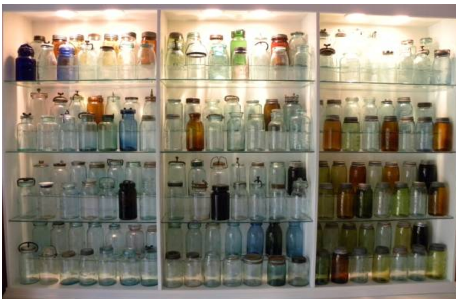
Bed Room cabinet full of rare, scarce and fabulous colored fruit jars.