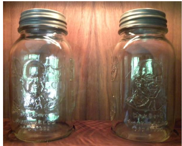
Two Ball made Commemorative jars RB #'s 381.5 & 382.