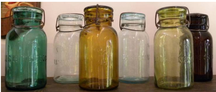
Very nice Lightning fruit jars.