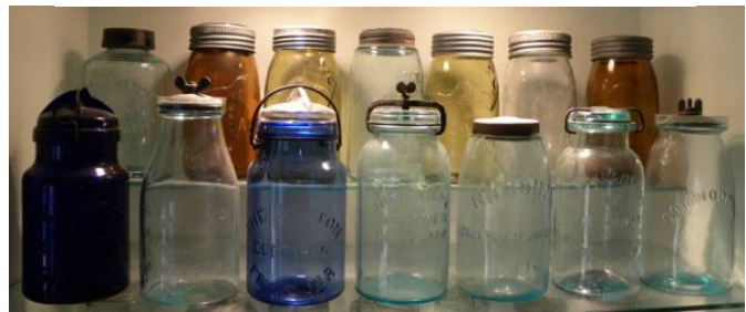
Fantastic colored and rare fruit jars.